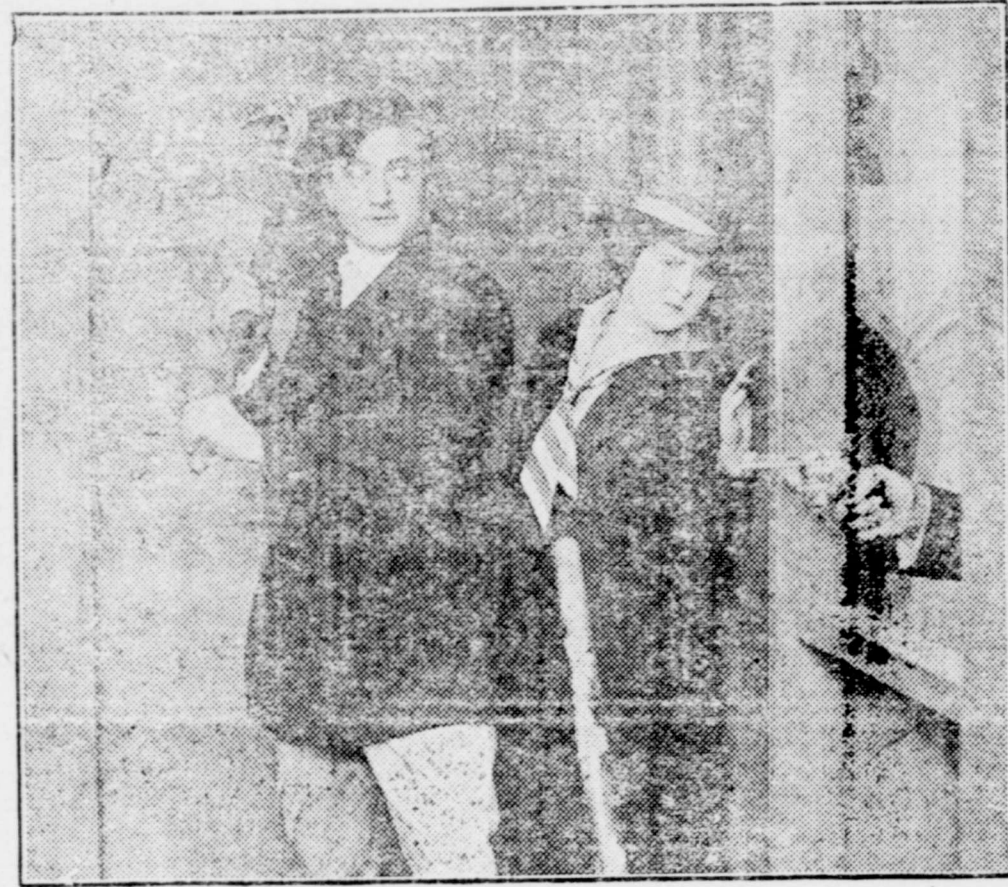
A SHOVEL AGAINST A PISTOL.

"Let's phone the Big Chief," suggested The Rat.