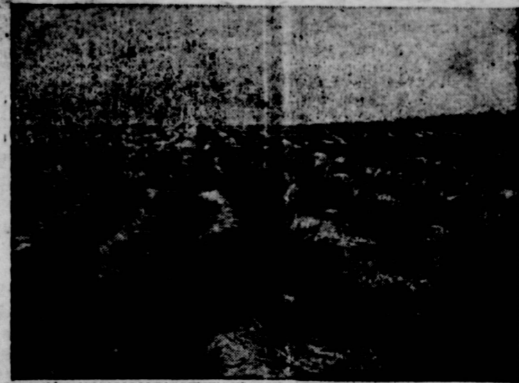
Contour farming on terraced lands holds the maximum rainfall in place for crop production and reduces soil loss resulting from run-off. A good vegetation program makes the above practices more effective.