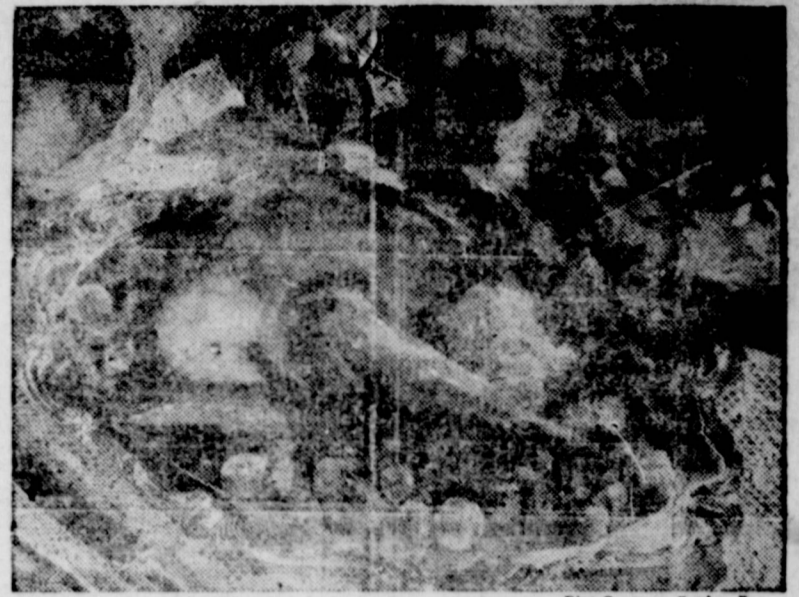
Rice Consumer Service, Inc.

Benjamin Franklin was the first Postmaster of the United States.