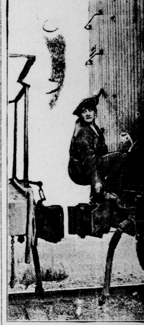
Judith Uncoupling the Caboose.

truding from the window of the special's engine, one on either side.