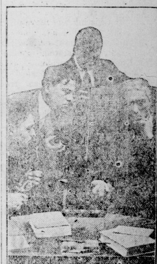
Charged With the Assassination of Alan.

of his Rose. The tenement occupied one corner of a narrow street. Directly opposite, a storage warehouse stood upon the other corner. Before this last was the common landing stage for truck deliveries, protected by a shed-roof. And, suspended from a timber that peered out over the eaves, a hoisting