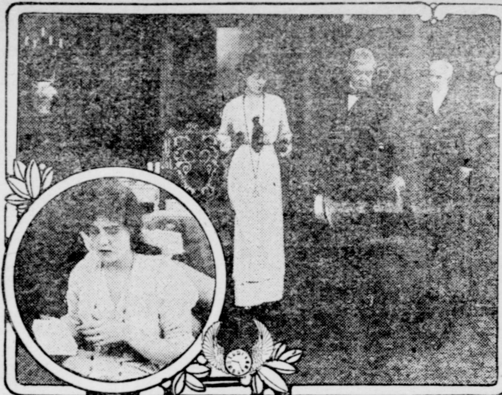
OUR MUTUAL GIRL studies the THUMB-PRINT. DUNBAR questions Mrs. KNICKERBOCKER about ANNI.

Our Mutual Girl, having lost her $50,000 cameo necklace, is in doubt as to the identity of the thief. Kid Joseph accuses Dunbar of the robbery. Dunbar establishes a complete alibi, or, at any rate, one complete effort to satisfy Margaret.