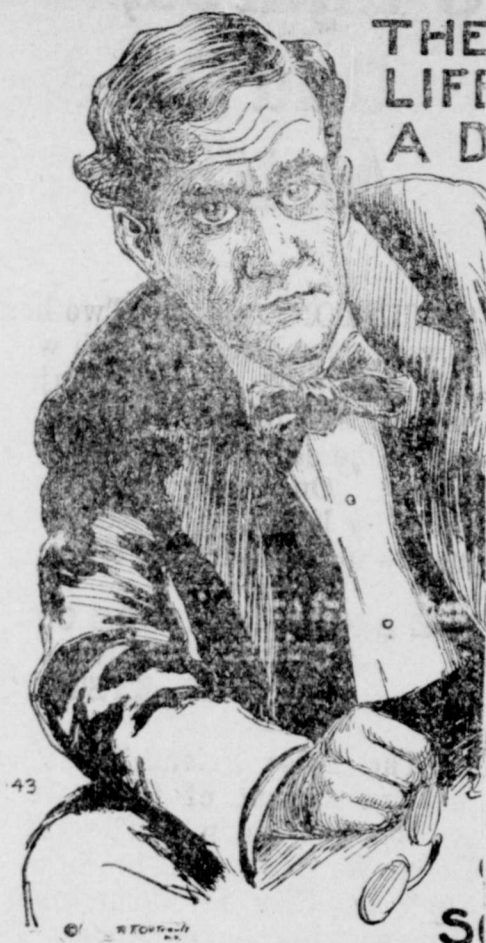
THE LIFE A D