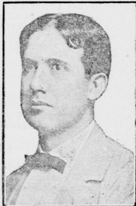
Hon. Wm. P. Hobby, of Beaumont.

demonstrations to be conducted in the various London hospitals, of which there will be an average of twenty a day. General sessions will be held each evening at the Savoy and Cecil hotels at which papers will be read and discussed by the foremost surgeons of both England and America.