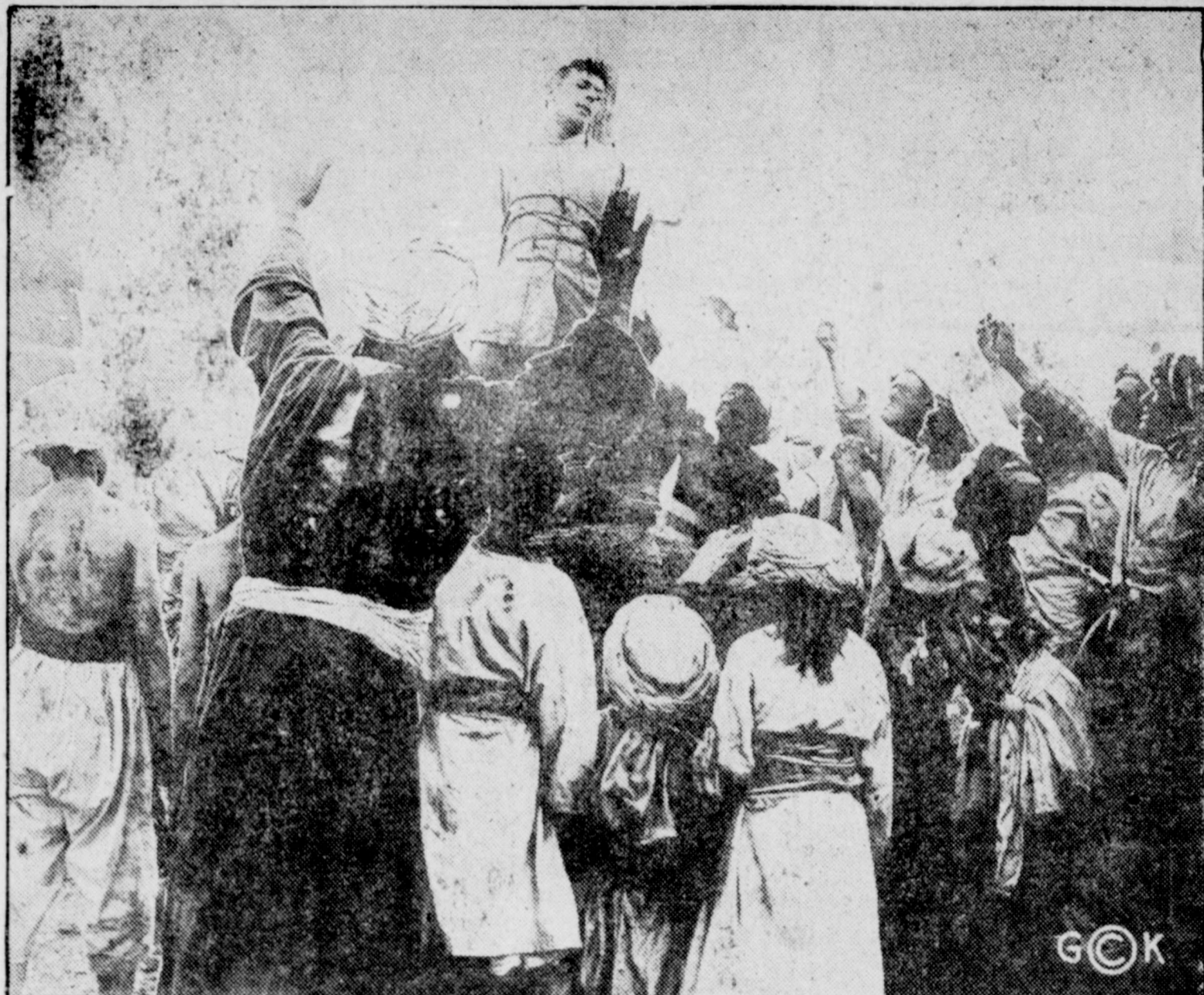
"Between Savage and Tiger" White City Monday, June 15.