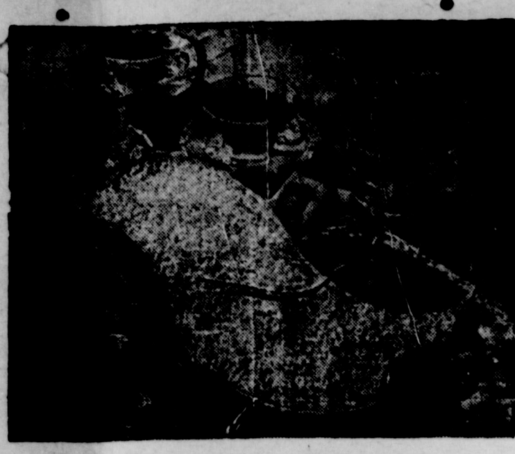
Almond Chicken With Rice

Figure with us before you buy Ph. Hi 2-2361 Cisco, Tex