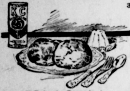
K C Apple Dumplings

Here is a new way to make apple dumplings that will surely please every housewife, for it is not necessary to have whole apples, and the juice cannot run out and burn as in the old dumplings where the apple is placed in the center and the dough turned up around it. The biscuit part forms a crispy shell that holds the apples and juice.