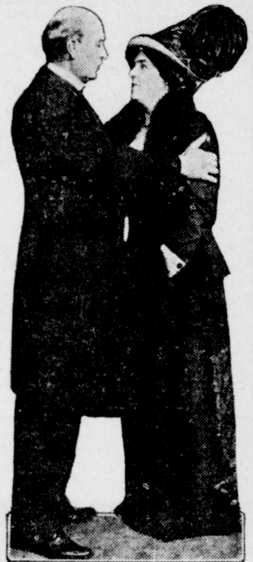
"What Was the Delay?" Asked Blake.

"She isn't a fool. She's rather pretty, too. She's got a strangle hold on