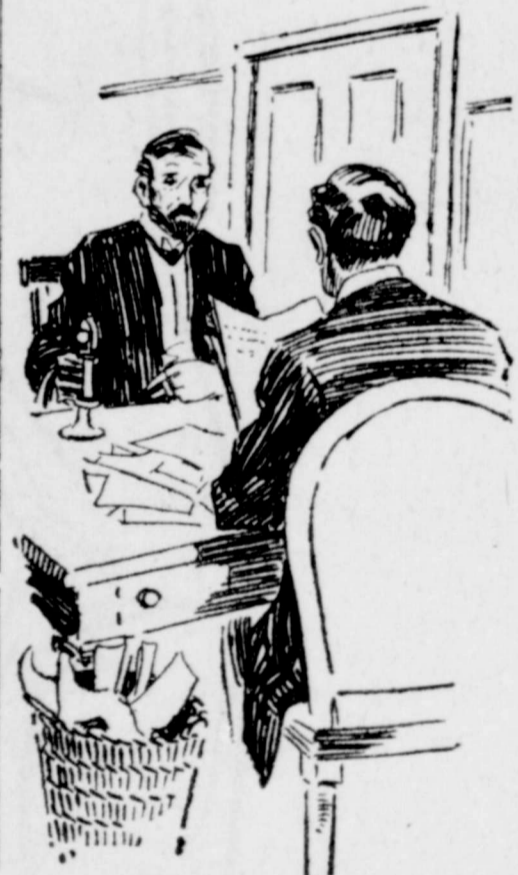
"Cut Out Any Flowery Stuff and Bang Away at the Point."

"That's absurd. You don't know—" "Absurd or not," snapped Blake, "it's got to stop short! I'm not going to let you throw yourself away on a girl like that. If it comes to a show-down, I'll withdraw my support from you. And then what can you do? Hey? Answer me that. Here I've given you the softest snap there is—a big salary for loafing around an office a few hours a week. How much could you