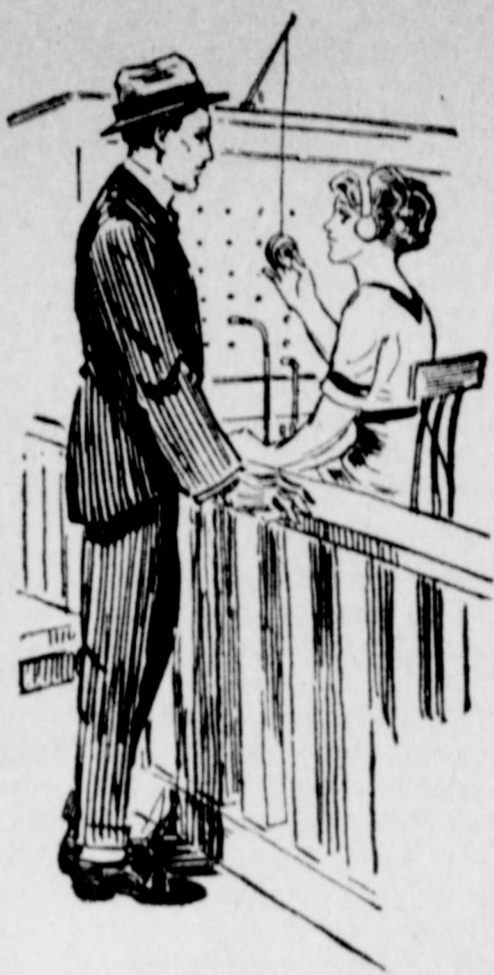
"I Got as Much Pride in My Own Way, I Guess, as You Have, Maybe More."