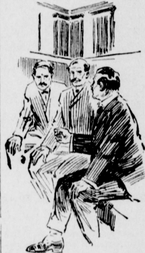
"Hain't He Put Your People into the Way of Grabbing Millions?"

A man came leisurely down the stairs and laid one hand on Robertson's arm. Voice and action were calm, even pacific. Yet they slammed shut the New Yorker's floodgates of wrath and left him speechless, nervous, almost apologetic.