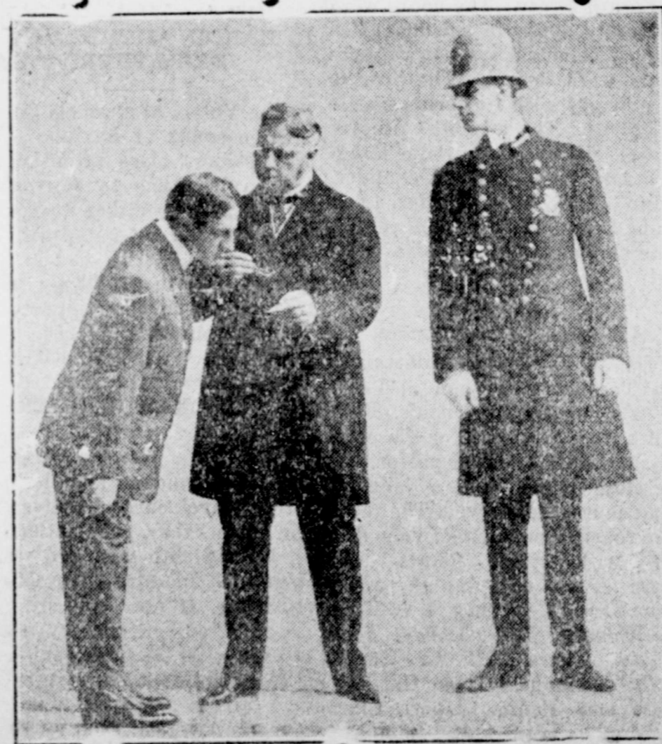
Scene from Geo. M. Cohan's Musical Success "The Little Millionaire," Opera House Wednesday, March 4th.