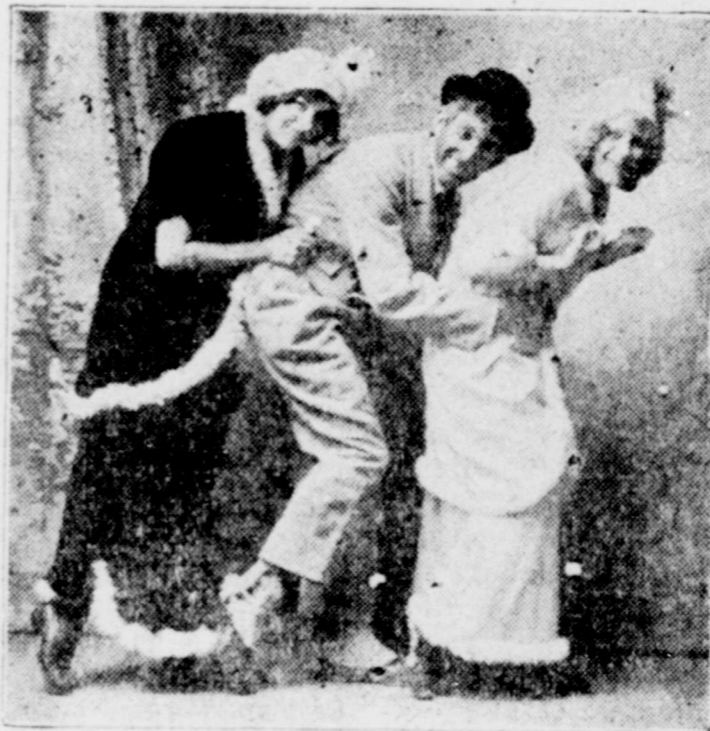
Scene from "The Girl and the Tramp" Opera House Tuesday, March 3rd.

For Sale. 400 bales Alfalfa hay 59c per bale. The Globe. Phone 320. 27-6td 1-3td 1tw.