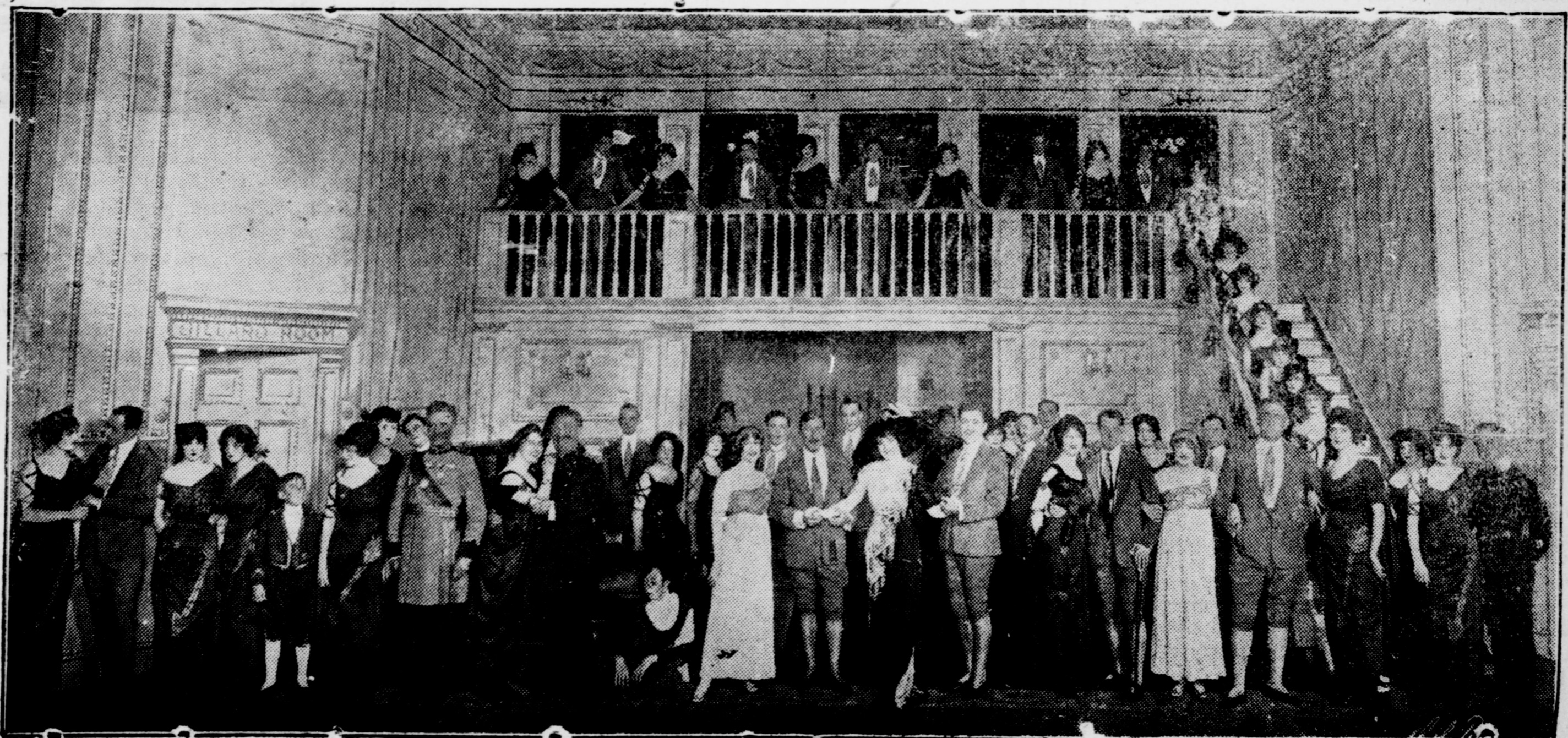
Scene from Geo. M. Cohan's Big Musical Success "The Little Millionaire" Opera House, Wednesday, March 4th.