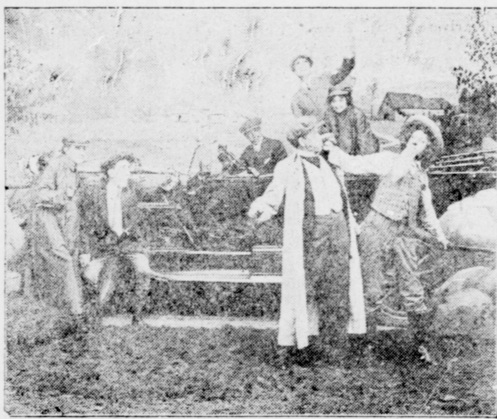
Scene from Edison's Talking Pictures, Princess Theatre Matinee and Night Saturday, February 28th.