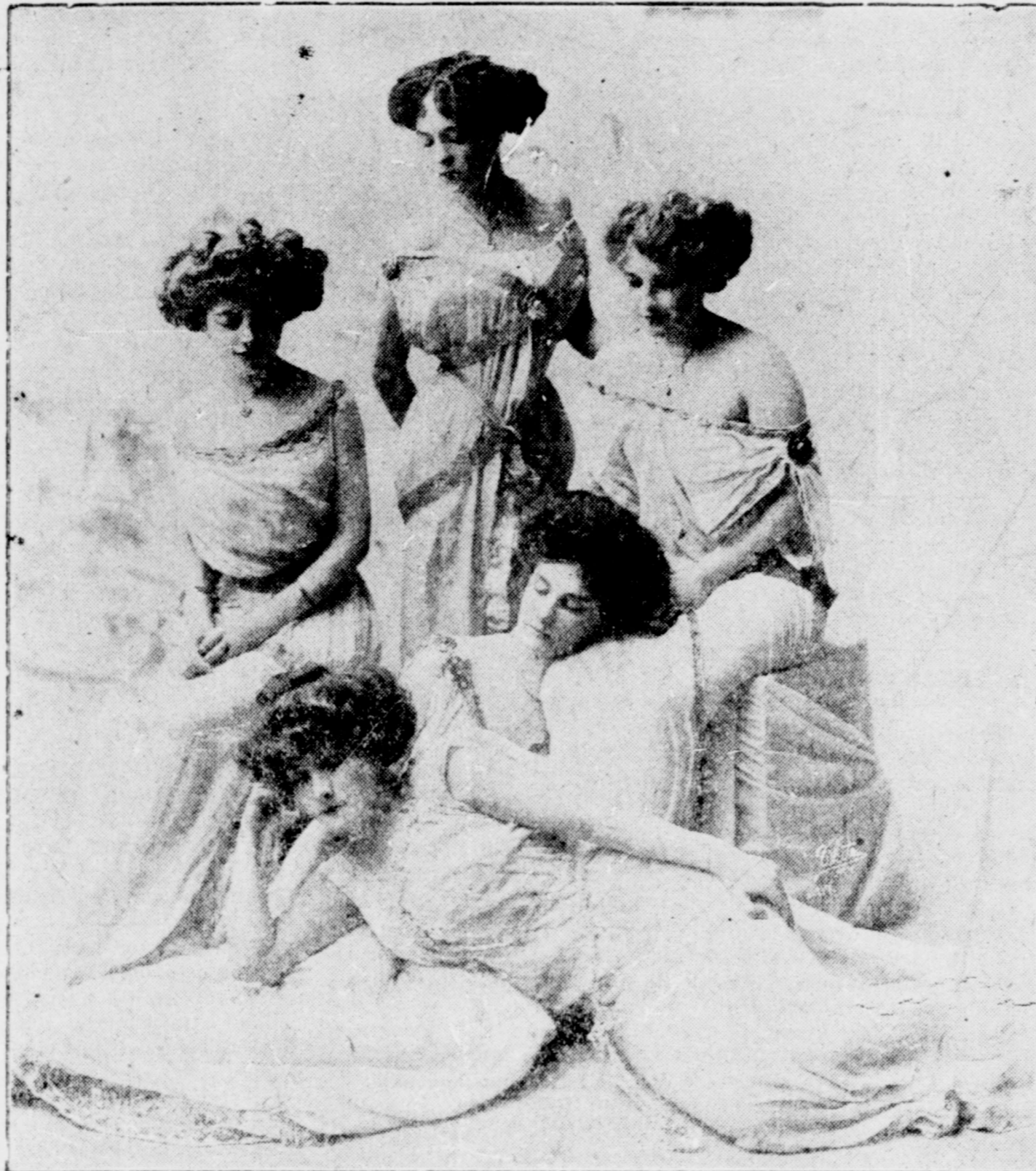
Pretty Girls with Mutt and Jeff Opera House Saturday February 28th.

Did you ever realize how much meaning there is in the ordinary expression "Make good"? Bud Fisher, cartoonist on the New York American staff, conceived the idea of two eccentric characters whom he called "Mutt and Jeff." At first these pictures created but little comment, but like wine they improved with age. Soon the pictures began to attract the attention of the children, then grown folks became interested, then doctors, lawyers, brokers and professional men of all sorts found themselves unconsciously opening the American at the funny page to see what new stunt "Mutt and Jeff" were up to. It practically became a disease until not only all of New