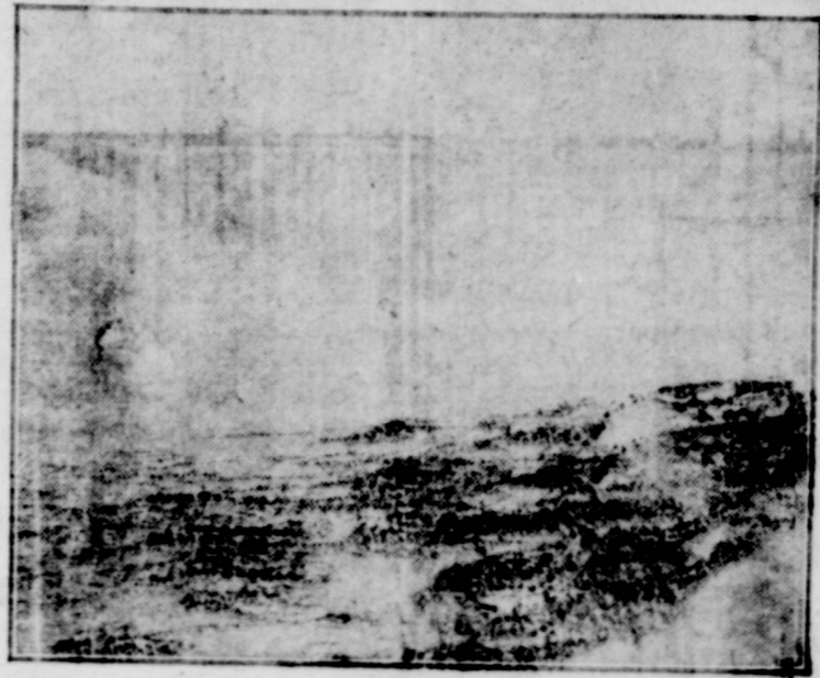
Soil blown against fence rows is lost from crop production.

Luther Curtis is seriously ill in the Gorman Hospital after suffering a stroke.