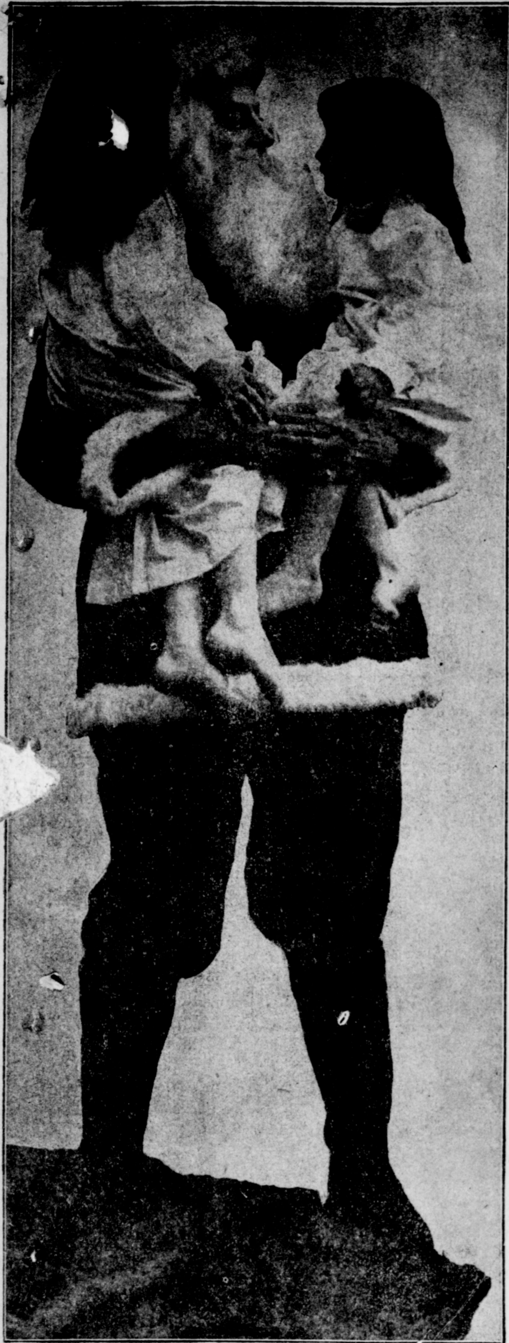
"THE EMPTY STOCKING"

First Baptist Church. No preaching at our church on Sunday, but every member of the Sunday school is urged to be