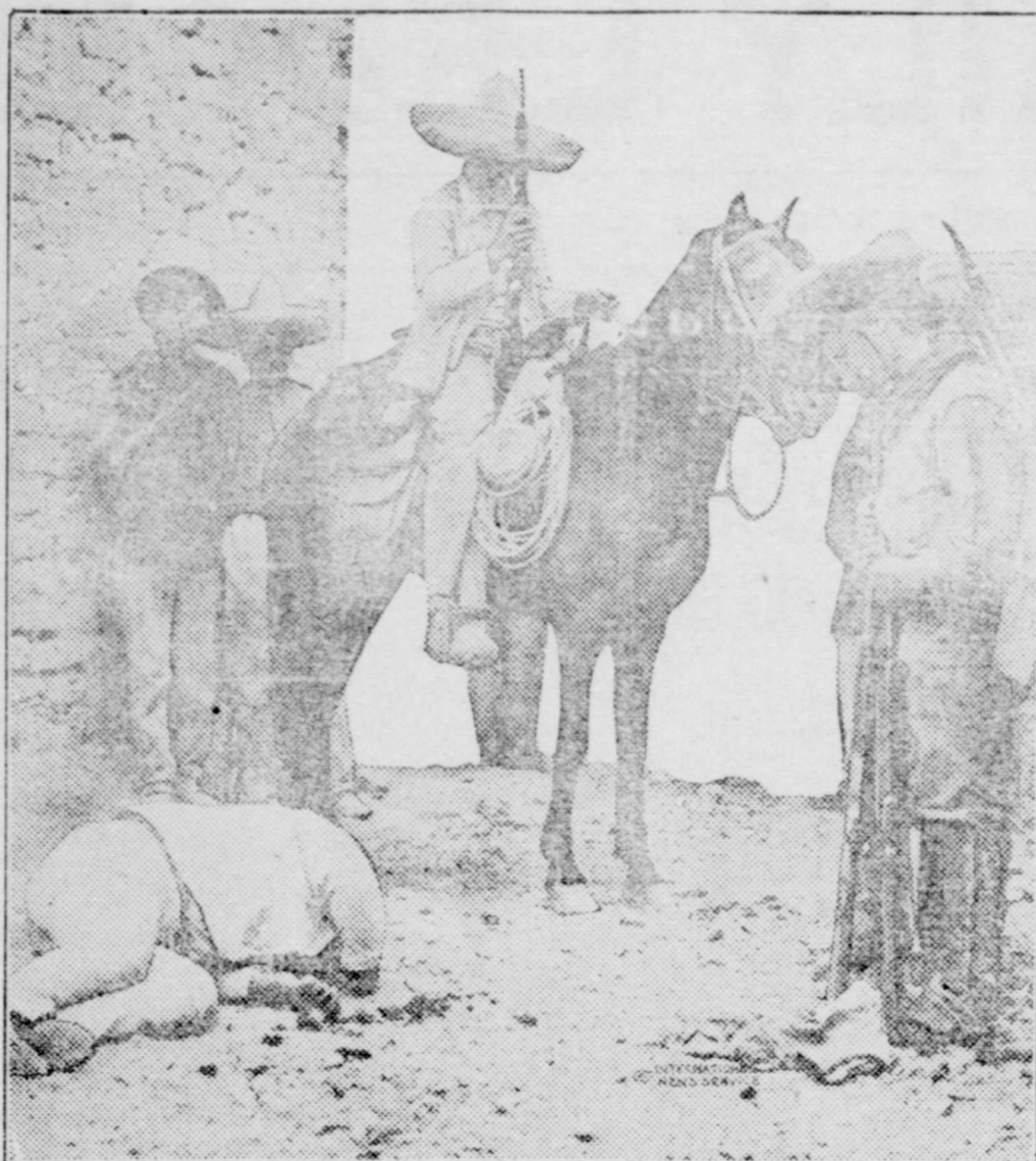
Death is the usual portion of the federal officers captured by the rebels, and though this one disguised himself as a private he did not escape the vengeance of his enemies.