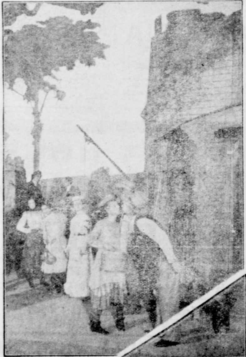
Scene from "SIS PERKINS" Opera House Tonight

A Painless Headache. Is there such a thing as Painless Headache, Painless Neuralgia, Painless Rheumatism. Hunt's Lightning Oil will make the pain go away and the suffering cease. That's why Hunt's Lightning Oil is so popular, and praised so much. Ask your druggist.