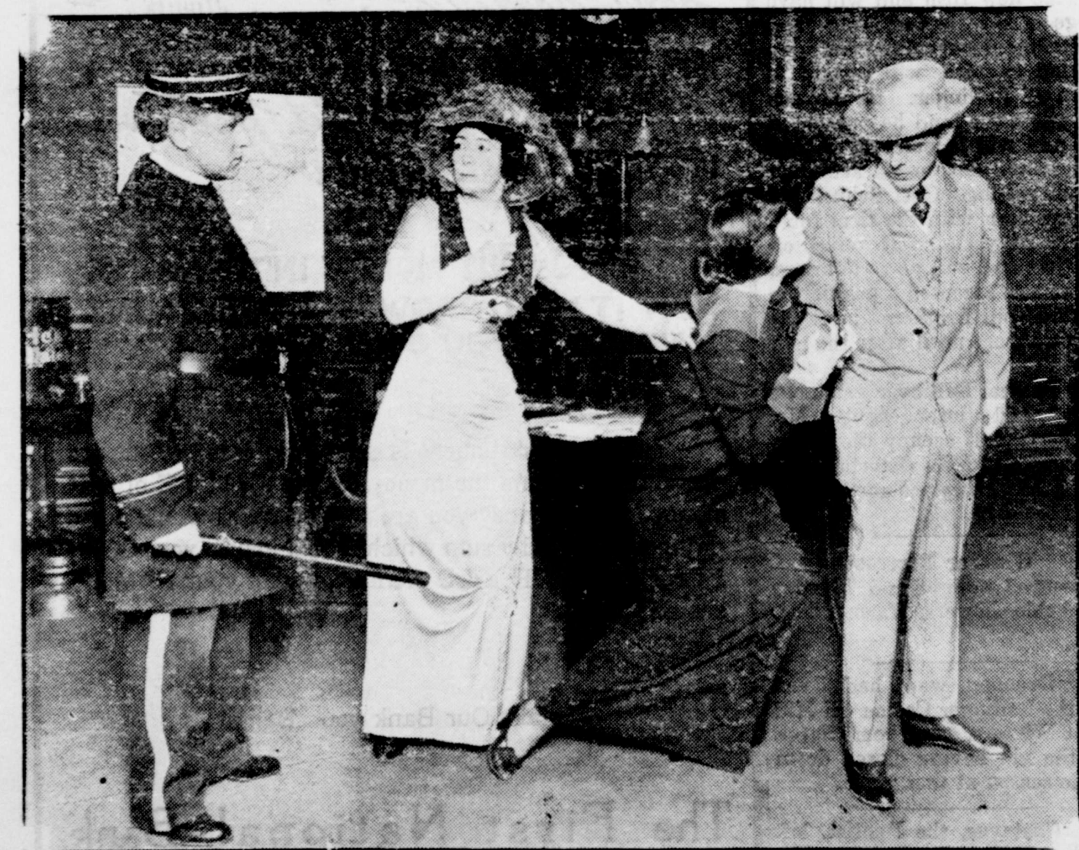
Scene From "The Traffic" Ballinger Opera House Wednesday Night, November 26th,