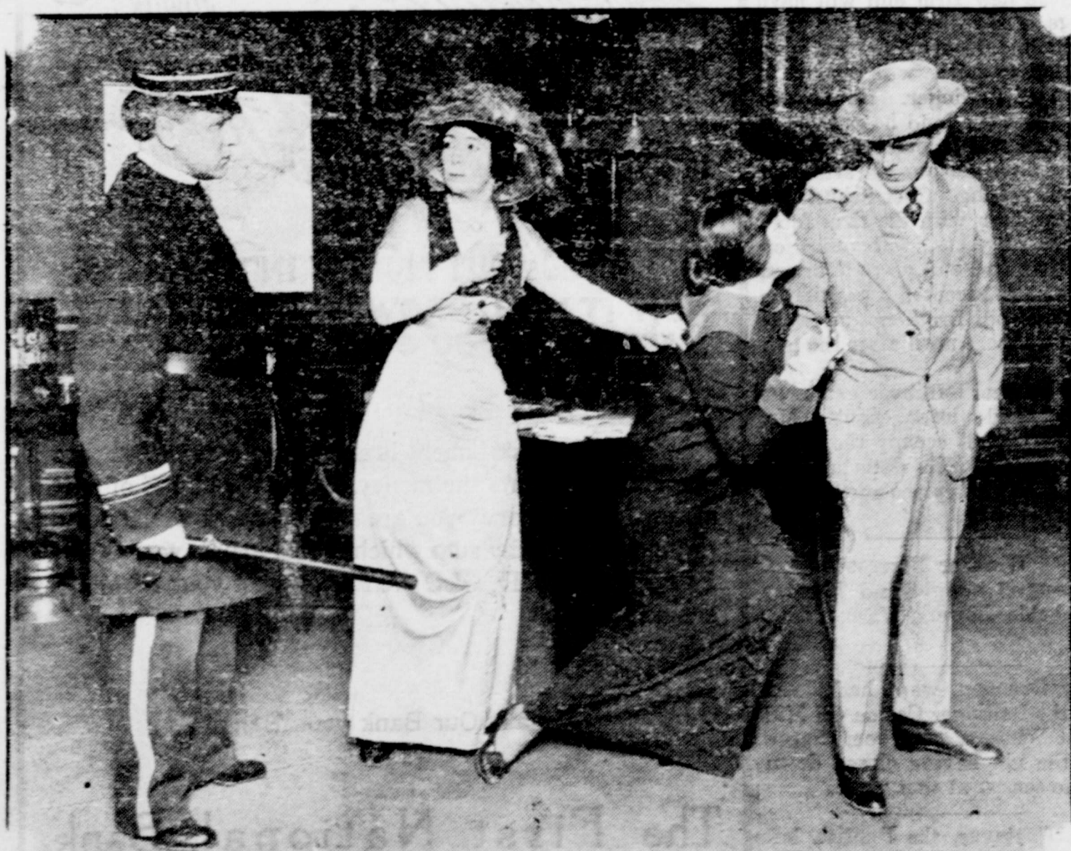
Scene From "The Traffic" Ballinger Opera House Wednesday Night, November 26th,