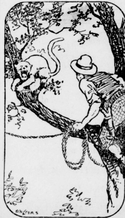
Climbed into the Tree With the Noose.

rope touches its neck, and not infrequently entangles the lariat in the limbs and strangles itself ignominiously. If it leaps clear, however, Ordish is sure of a fat sum in return for his daring, for the lions find a ready market in the zoos, parks and circuses.