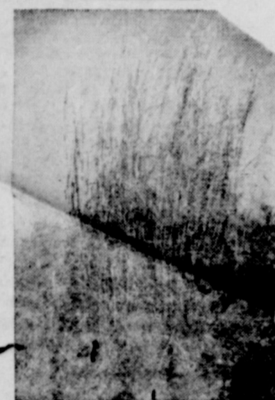
Little bluestem shooting up seed stalks. Seed stalks are being produced unusually early this year. Little bluestem is one of the better basic grasses needing reseeding in this area. Livestock relish the seed in the dough stage and must be removed from a pasture for seed production.

grassland for their temporary crops on cropland fields. As one travels about the country he sees fields of succulent sorghum, alfalfa, and johnson grass. These fields are ideal for being rested from a seed crop.