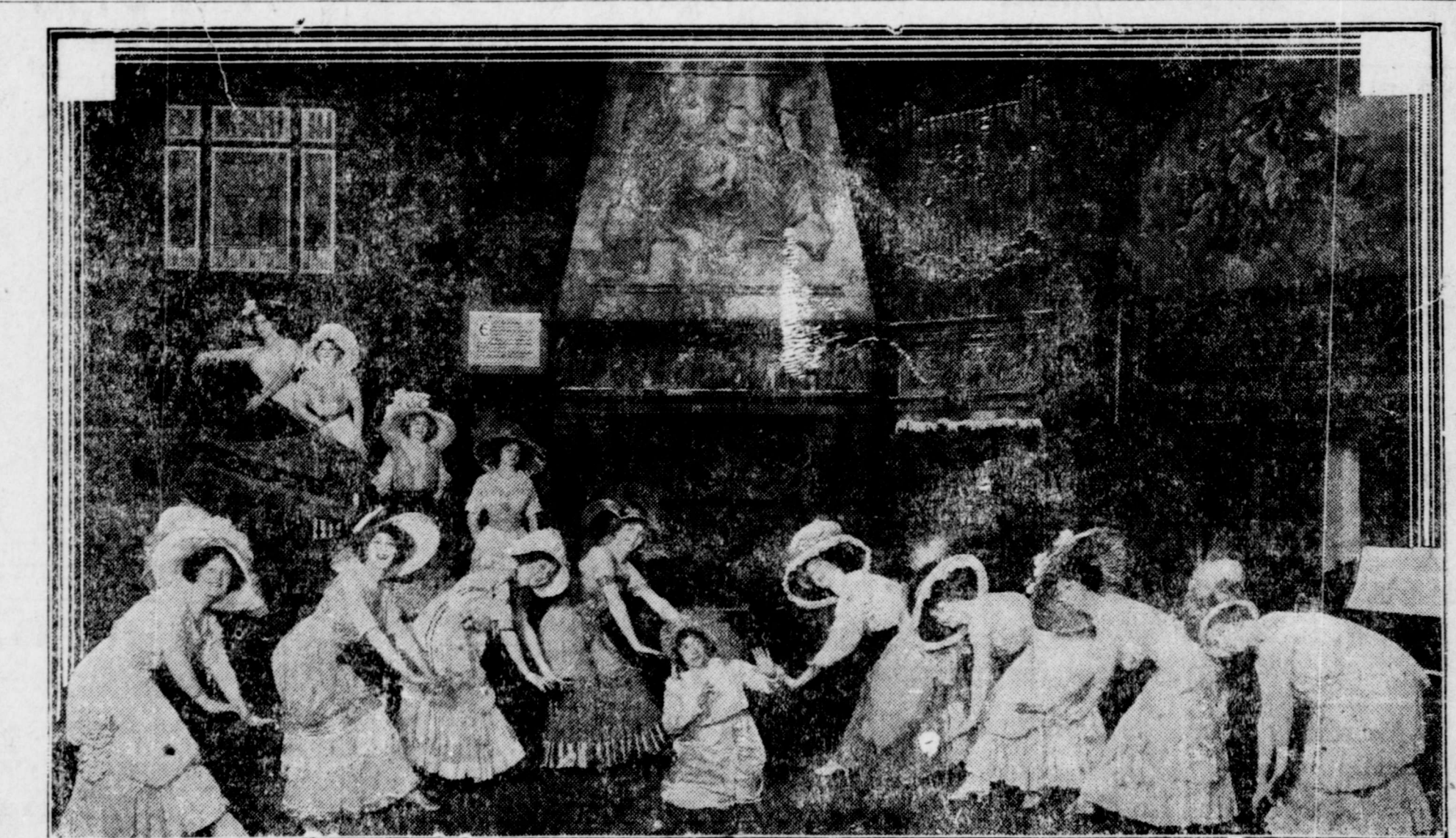
Awaking of the Butterfly in Madam Sherry at Opera House Tonight.