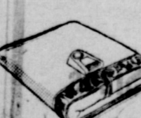
ELECTRIC BED WARMER

You lighten Mother's household routine and help make living more pleasant for the entire family when you give electrical gifts. Select a new electric skillet with automatic heat control. Or choose an electric food mixer that eliminates wearisome hand mixing. Or make your selection from the dozens of other exciting and useful electrical gifts at your favorite store that sells appliances. You give better living when you give something electrical!