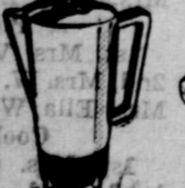
ELECTRIC COFFEE MAKER