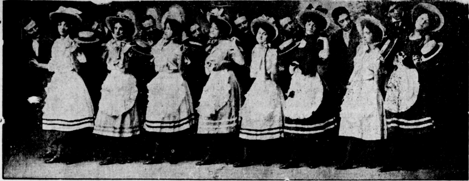
"So-Long Mary" Girls and Boys in "45 Minutes From Broadway" at the Opera House TONIGHT