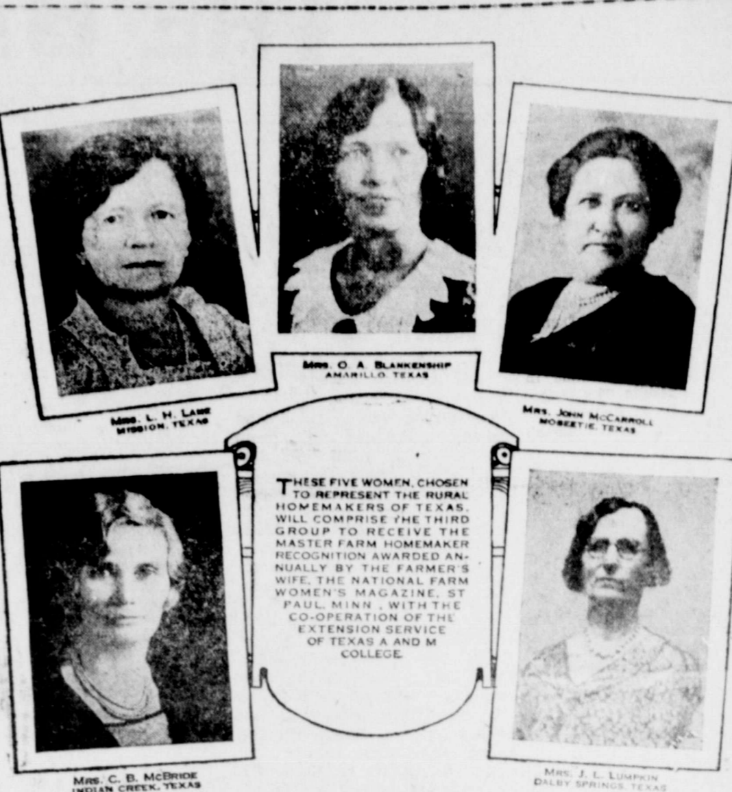
THESE FIVE WOMEN, CHOSEN TO REPRESENT THE RURAL HOMEMAkers OF TEXAS, WILL COMPRISE THE THIRD GROUP TO RECEIVE THE MASTER FARM HOMEMAKER RECOGNITION AWARDED ANNUALLY BY THE FARMER'S WIFE, THE NATIONAL FARM WOMEN'S MAGAZINE, ST. PAUL, MINN., WITH THE CO-OPERATION OF THE EXTENSION SERVICE OF TEXAS A AND M COLLEGE.

COLLEGE STATION, July 28.—Texas farm women as very material contributors to the welfare of the state were honored on the opening day of the twenty-first annual Farmers Short Course here today in the award by The Farmer's Wife, national farm women's magazine, St. Paul, Minn., with the cooperation of the Extension Service, A. & M. College of Texas, of the title Master Farm Homemaker to five outstanding farm wives of the state.