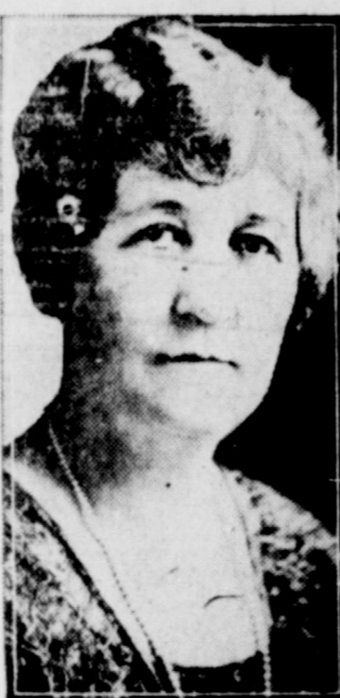
Mrs. Miriam Ferguson