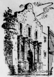
The Immortal Alamo

Maxwell House is specially blended to suit the Southern tea lover. Fragrant, hearty, true tea flavor in a blend of choice Ceylon and India teas. Mellow, delicious! Ask your grocer for Maxwell House Tea today.