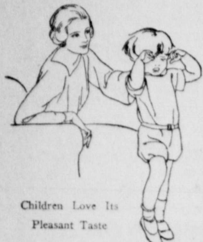
Children Love Its Pleasant Taste

"California Fig Syrup" is Dependable Laxative for Sick Children