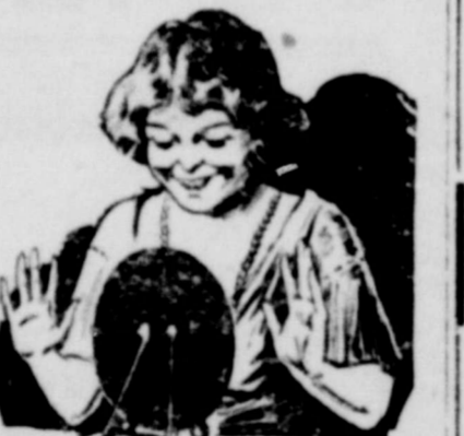
"Ironized Yeast Has Cleared My Skin Quickly and Gloriously!"

There is nothing in the world today which is producing such a sensation as this simple discovery! Pick out anyone who has healthy rosy cheeks and a ravishingly beautiful complexion, and you have picked out an individual whose blood