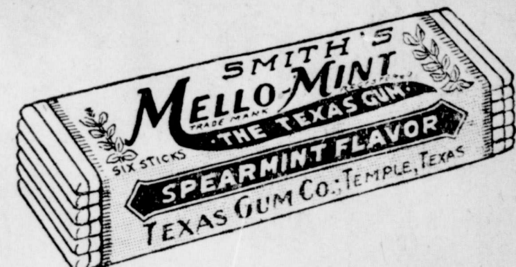
"Smith's MELLO-MENT" 6 sticks Spearmint Flavor.

We wish to ask a neighborly favor—we live in Temple, Texas, and we manufacture CHEWING GUM—Started "on nothing" and now have largest Gum factory in the South. Must be some merit to our goods. Please get these brands in your mind. They are sold in your town.