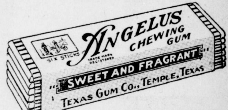
"ANGELUS CHEWING GUM" 6 sticks Highly Fruit Flavored. Also, ANGELUS in Foil Wrapper.

The favor we ask is this: GIVE OUR GUMS A FAIR TRIAL. We are glad to inform our friends that we are selling Texas Gum in several states, traveling representatives, and that we are "getting in" on our merits, whereas the big factories are spending millions in advertising their wares. TEXAS GUM CO., Temple, Texas