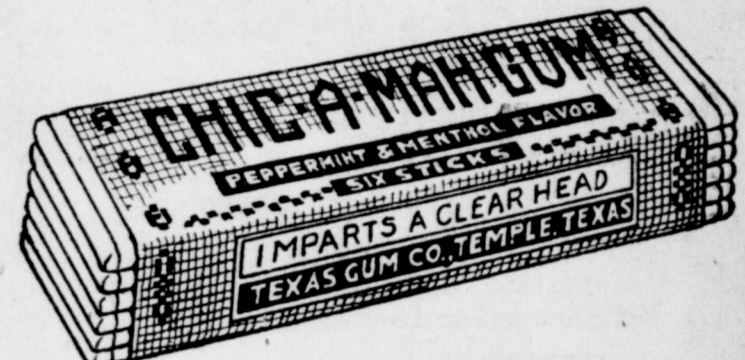
"CHIC-A-MAH GUM" 6 sticks Peppermint and Menthol Flavor.