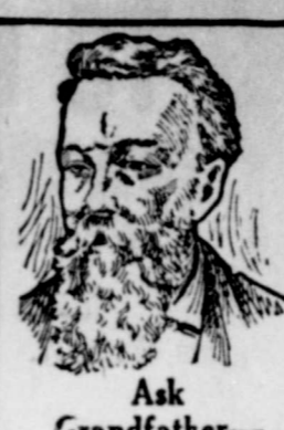
Ask Grandfather—He'll Tell You—