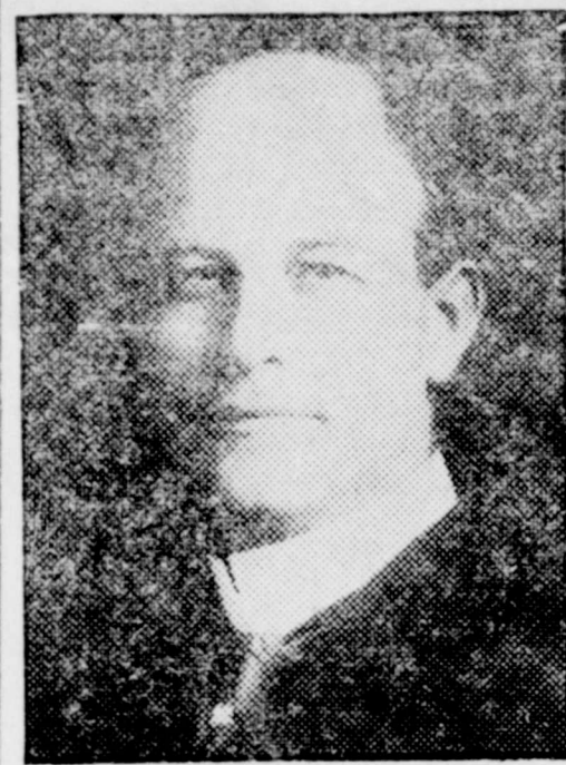
Capt. R. P. Hobson

It is announced in connection with the great campaign that is being conducted by the Anti-Saloon League of Texas, going to the four corners of the State, carrying the story of prohibition to approximately 400 towns and cities, that we will have as one of the speakers, Capt. R. P. Hobson, known as "the hero of the Merrimac" and a man who has sacrificed his life in the interest of prohibition, who presented a resolution in Congress asking for nationwide prohibition. Capt. Hobson will address the citizens of Ballinger, April 10, 8:00 p. m., at the Methodist church.