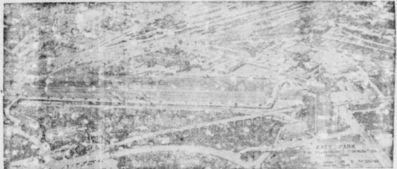
THIS IS THE architect's conception of the new $50,000,000 project in downtown Houston planned for construction within the near future by the Katy Park Industrial Development Corporation. It will include a temporary warehouse (left) nearly 2000 feet long and 200 feet wide, and a 25-story office building and Kansas-Texas station now stands. Architect for the project is Wyatt C. Hoarck. Construction will be by O'Rourke Construction Company, of Houston.

Myrick said the City of Cisco had assigned approximately 30 acres of city property for the present show barn and race tracks, to the association for development under a long term lease.