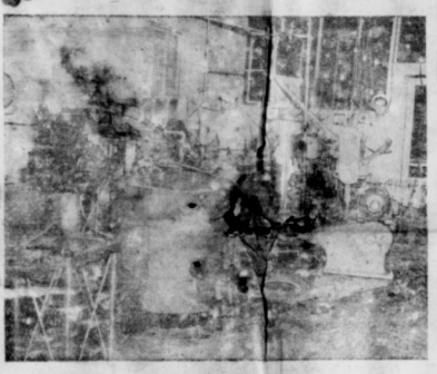
Pasturization Department of Kilgore's

The plant has been completely outfitted with new equipment in the past four years. Grade "A" Milk and Ice Cream is delivered in Modern, Refrigerated Trucks . Speed and Complete Service from the Producer to the Consumer, assuring that ess and Quality of KILGORE'S PRODUCTS will always