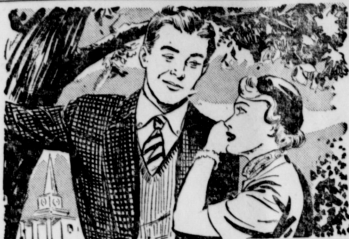
Are men capable of true love?

Answer: Of course! The question would scarcely be worth answering but for the fact that there seem still to be a number of embittered women who insist that men are interested only in sex.