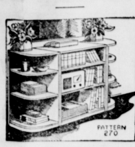
Unit Book Shelves

THESE SHELVES may be made to fit different wall spaces by changing the length of the center unit or by adding extra sections. Pattern 270 gives directions and an actual-size guide for cutting curved shelves. Price 25c.