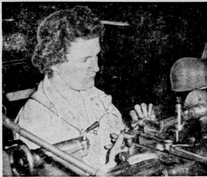
DURING WORLD WAR II women, like the one above using a turning tool, proved highly efficient workmen in plants where women had never before been employed.