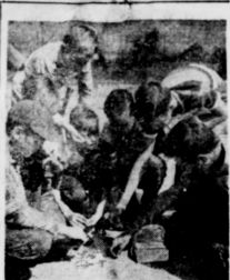
These boys are in danger of losing their hands and eyesight, even their lives. The explosion of one of the caps they are handling could set off the remainder. The blast would be horrible.

trical cap is a thin wire which becomes heated and explodes the charge when an electric current is passed through the lead-in wires.