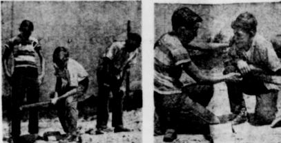
... and setting it off with a baseball bat looks like a lot more fun than playing sandlot baseball. . . .