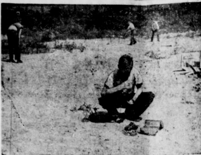
HERE'S HOW BLASTING cap accidents start—a youngster finds a deceptively harmless-looking lot of shiny tubes lost from a construction job or mine operation. . . .

HARRY HEILMANN had a habit of leading the American League in batting in odd years—1921, 1923, 1925, 1927.