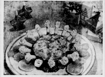
Star Pork Crown Roast for Chi (See Recipes Below)