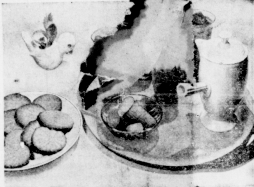
Cookies Rate High at Snack Time (See Recipes Below)