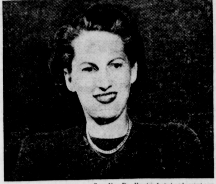
Says New Dry Yeast is fastest and easiest ever

To prevent unpleasant odors when boiling fish or shellfish, place a stalk of celery in the pan during cooking. To avoid crushing or tearing fluffy meringue on a pie, coat your knife or server with butter before cutting into it.