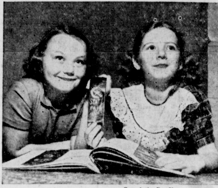
Says Active Dry Yeast is easy to us

AMAZINGLY QUICKER ACTING INCREDIBLY MORE EFFECTIVE