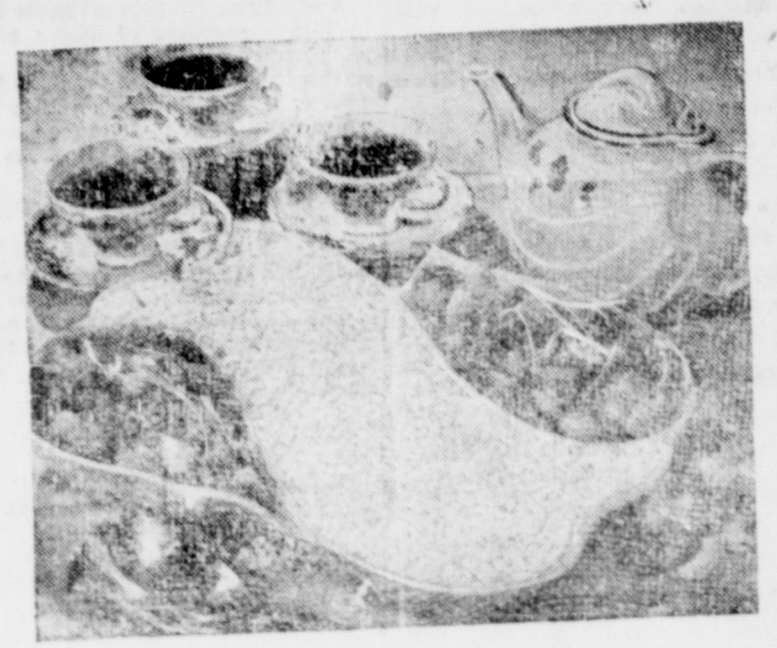
Almond Chicken With Rice

opping, is sure to please your family. It makes an attractive "one main dish type meal" and is easily served to a crowd. Fresh or canned mushrooms may be used for making Chinese Almend Chicken. NGREDIENTS