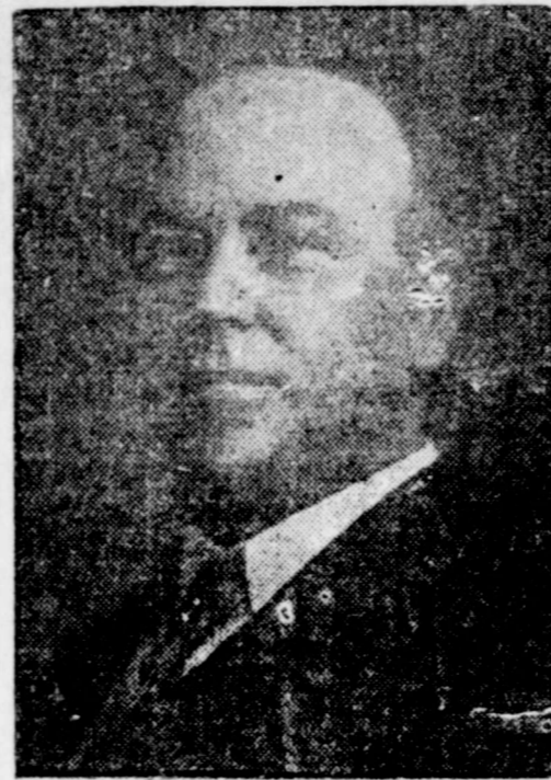
COLONEL JAKE WOLTERS, Candidate for United States Senate To Succeed Joe Bailey, Will Speak in Ballinger Monday, April 1st.

BALLINGER, TEXAS. Shoe repairing in connection.