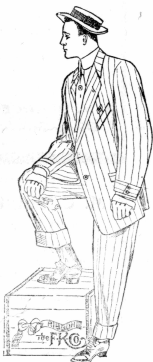
MENS SUITS AT HALF PRICE.

Now is your chance to buy a Good Suit for less than Manufacturers cost, but we must have money. Our loss is your gain, so here they go.