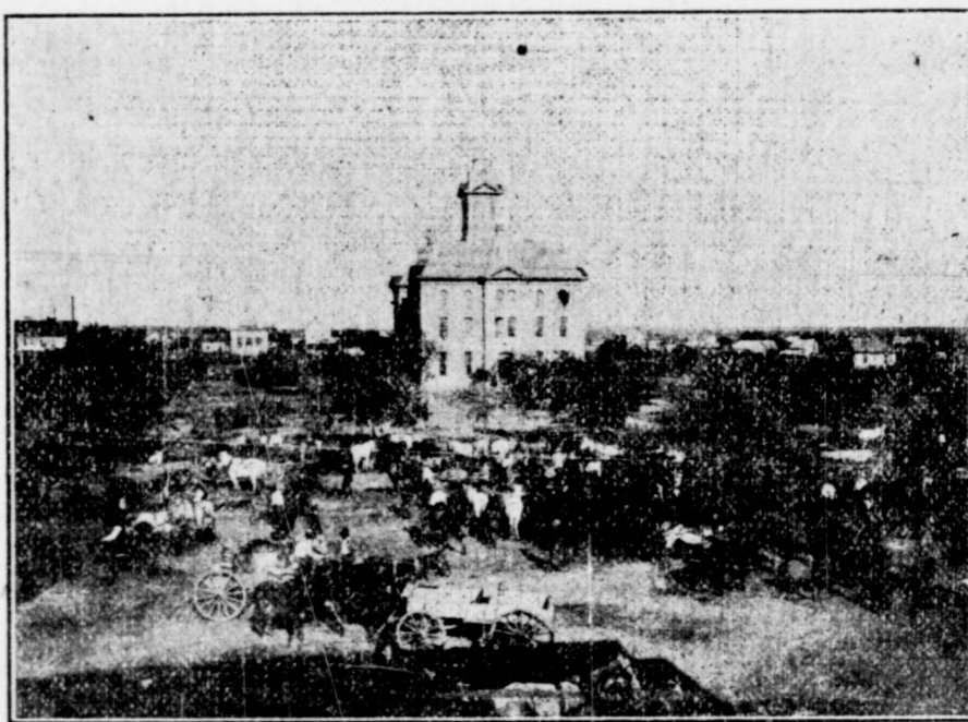
Public Square. A First Monday Crowd.

turned to sell a clock. These First Monday's are great things for a town, and the towns that havn't put them on should get busy. They bring together a crowd that gives the officers something to do, and keeps the booze joints running with extra forces, and the eating houses come in for their share of the business. Other lines of business stand off and enjoy the thought of what's to come after the first Monday crowd is gone.