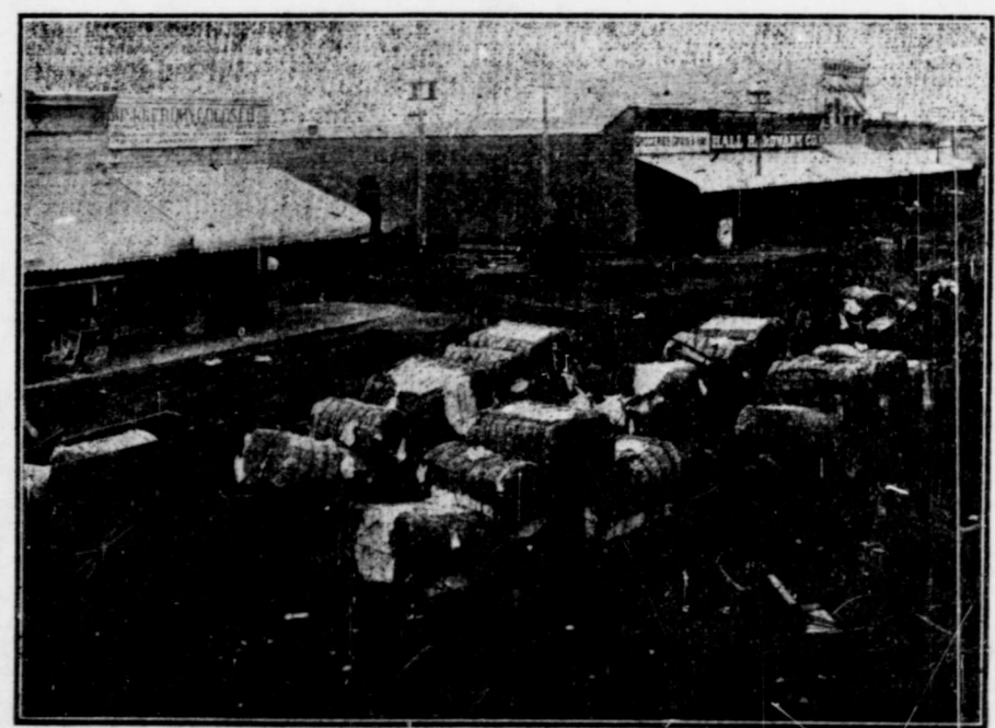
Scene on Hutchings Ave. this Week

Ask about the beautiful $8 doll we are going to give away