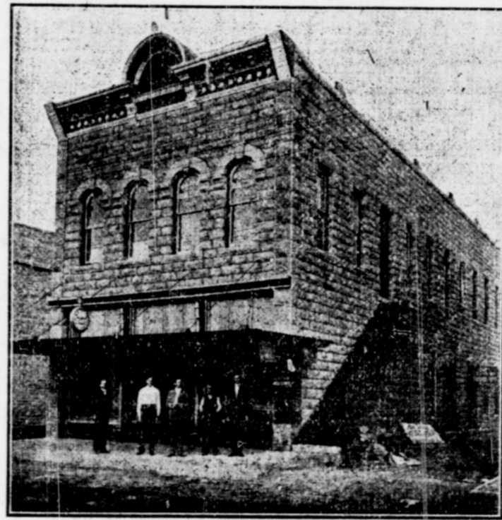
Our Handsome New Home---The best place for Christmas Presents

Excellence above all things should characterize gift jewelry, as it serves all through life as a token of remembrance. A sorry piece of jewelry is cheap at any price. We guarantee the kind we sell. Our new store is full of articles that will make nice presents, and we have something for everybody. We want to show you and quote prices.