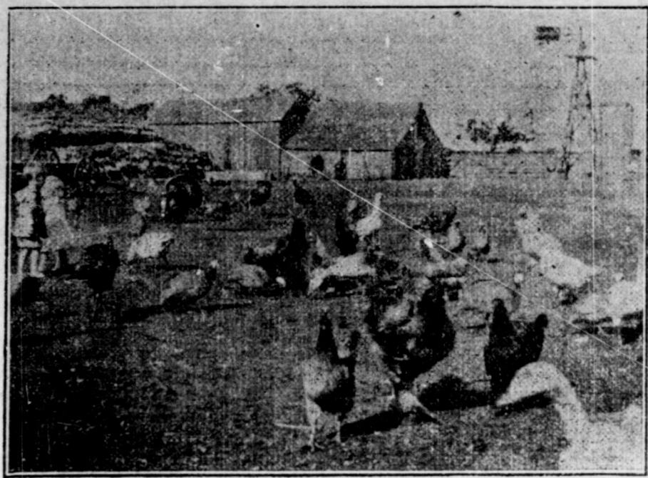
Runnels County Poultry Scene

Rasbury & Bruce are shipping a car load of turkeys, to-day.