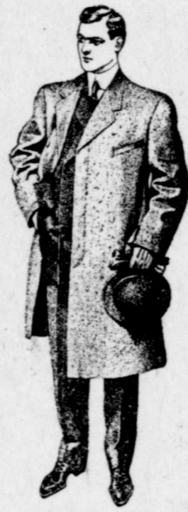
Copyright 1907 The House of Kuppenheimer Chicago

Boys Overcoats in Grey and Brown, extra long, good weight for school wear, ages 5 to 20, all prices from $3.50 to $5.00