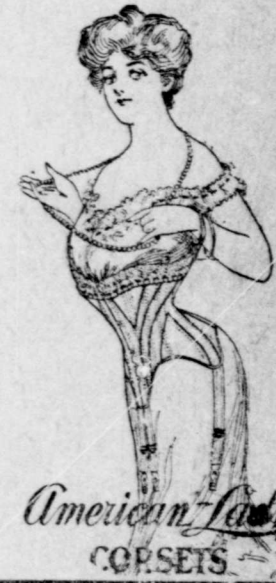
American Lady CORSETS

Children's Skeleton Waists, the "Teddy" the buttons won't pull off, they are very comfortable, we have them in all sizes 2 to 12 at 25c