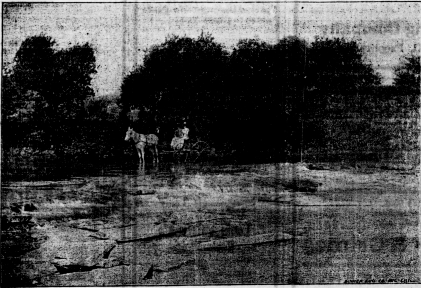
A scene on the Colorado River