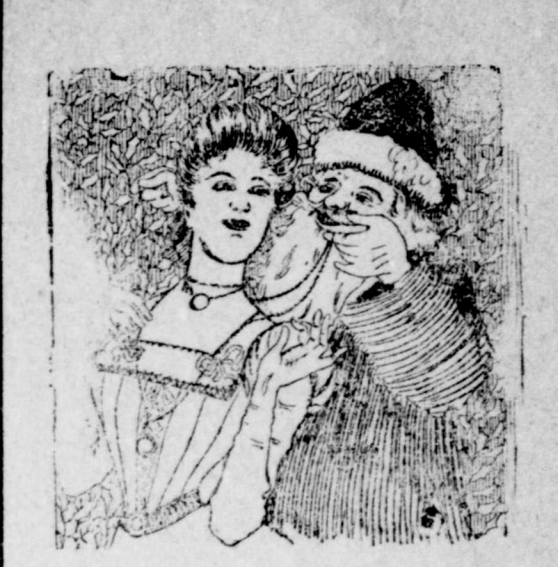
Santa Claus' headquarters are at Walkers.

Our Stock is the largest, the brightest, the newest and the cheapest. Call and see it and be convinced.