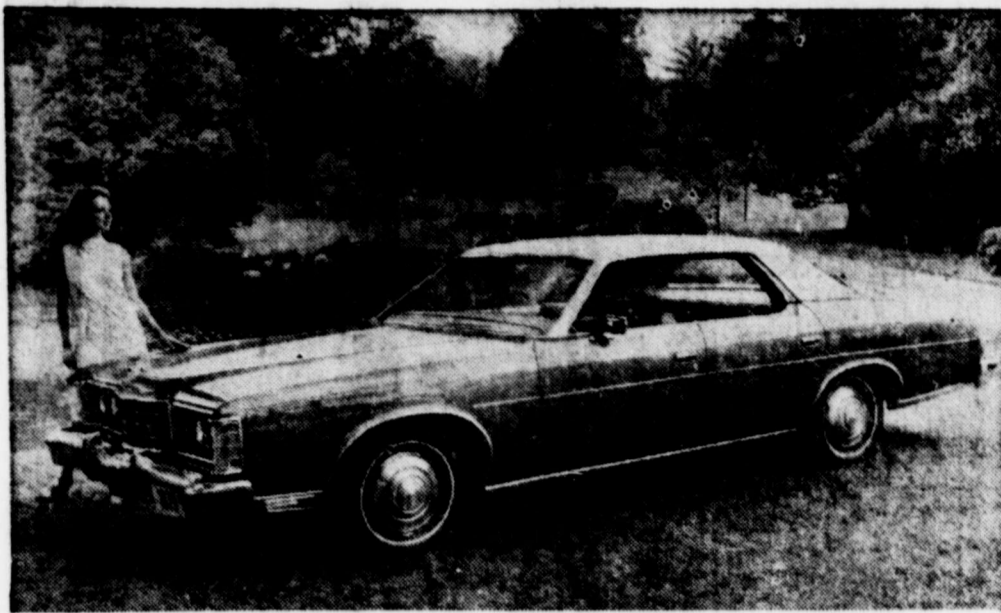
Most changed Ford Division car for 1973 is the full-sized Ford. Shown here is the LTD four-door hardtop. All-new sheet metal below the window line and a new segmented grille give the 1973 Ford a more formal look. All 1973 Fords have a new impact-absorbing bumper system, although the overall length of the car is increased only about one inch. Power front disc brakes, power steering, SelectShift Cruise-O-Matic transmission and a 351-2V eight-cylinder engine are standard in all new Fords.