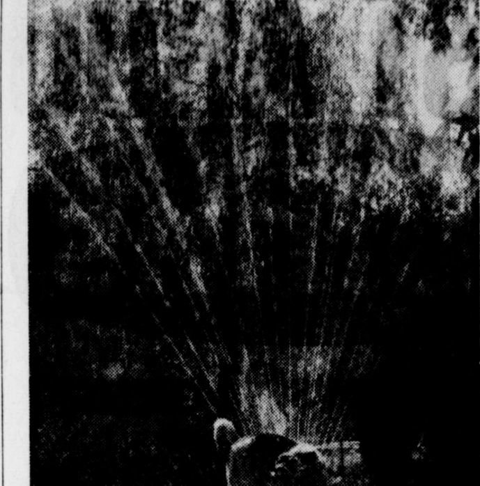
MAN'S MACHINE can be a dog's best friend on a hot day. "Obie" makes use of a sprinkler to take the edge off what he must have felt was a "dog day."

Phone 754-5419 — Box 216 — Winters, Texas 79567