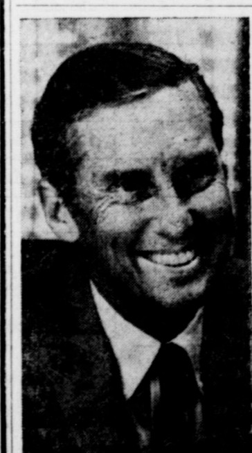
Bentsen Senator for the Seventies.