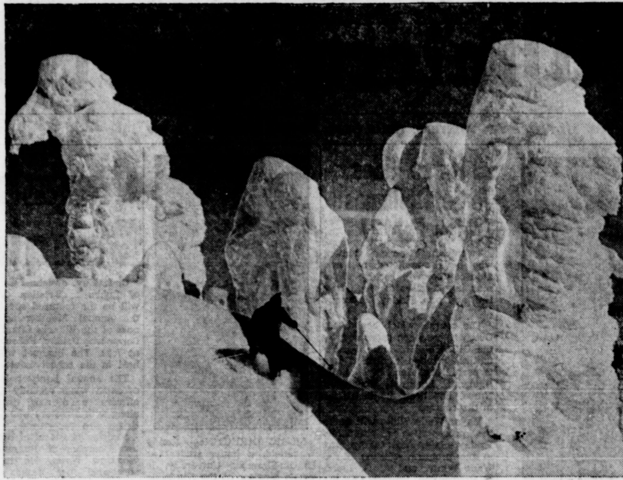
WHIPPED-CREAM SCULPTURES are naturally flocked trees found along the ski runs of a resort near Whitefish, Mont. There's a lot to see when you ski under the "big sky" of Montana. These "snow ghosts" are an example.