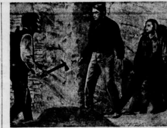
Omar Sharif, as a gold-hungry bandit chief, and Gregory Peck, as an Arizona Territory marshal named Mackenna, wage a desperate hand-to-hand tomahawk duel atop a legendary mountain of gold in Carl Foreman's giant of a movie, "Mackenna's Gold." Camilla Sparv is one of the co-stars in the Columbia release, in Super Panavision and Technicolor; others are Telly Savalas, Julie Newmar, Ted Cassidy and Keenan Wynn.